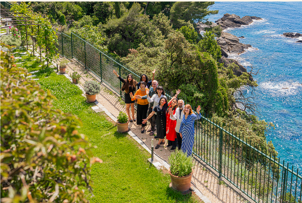
Spring 2025 Group Four Fellows

On May 2nd, along with dozens of other US arts organizations, Bogliasco received a communication from the National Endowment for the Arts rescinding our previously awarded grant. Publicly confirmed in January, Bogliasco's NEA grant had been designated to support our 2025 US visual arts Fellows, one of whom is currently in residence. The grant would have